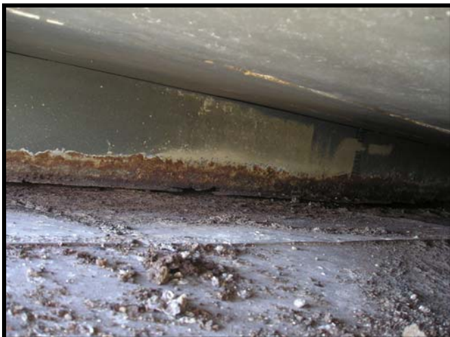
Corrosion on HVAC system due to accumulation of bird wastes.

With the use of specialized air/vacuum system, bird dropping can be safely removed and disposed of. Once droppings have been removed, the work area is then cleaned, disinfected and sterilized with the use of dry vapor technology.