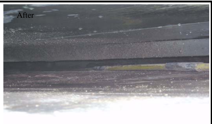
Specialized air systems removes bird droppings from duct work. With the use of air systems (no water), disposal costs are significantly reduced. Once bird wastes are removed; steam is used to sterilize and disinfect work area.