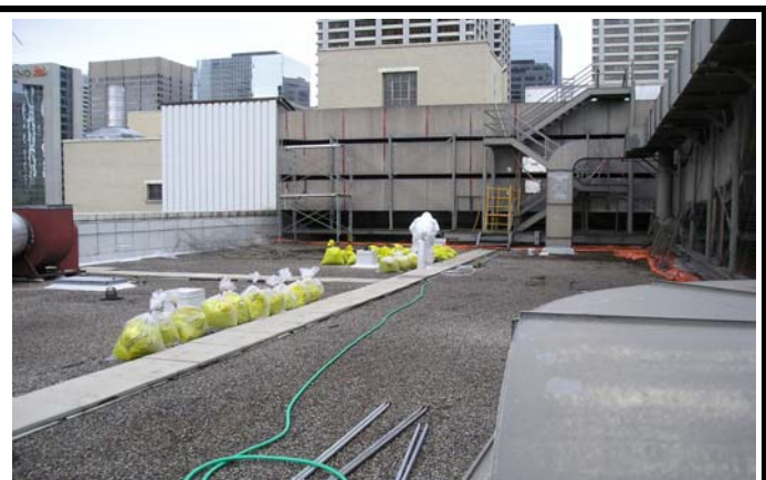
Once bird wastes have been removed from duct work they are double bagged and sealed with the use of specialized vacuum systems and are ready for proper disposal. .