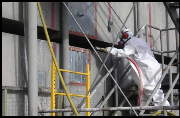
Bird wastes removed with specialized air system.